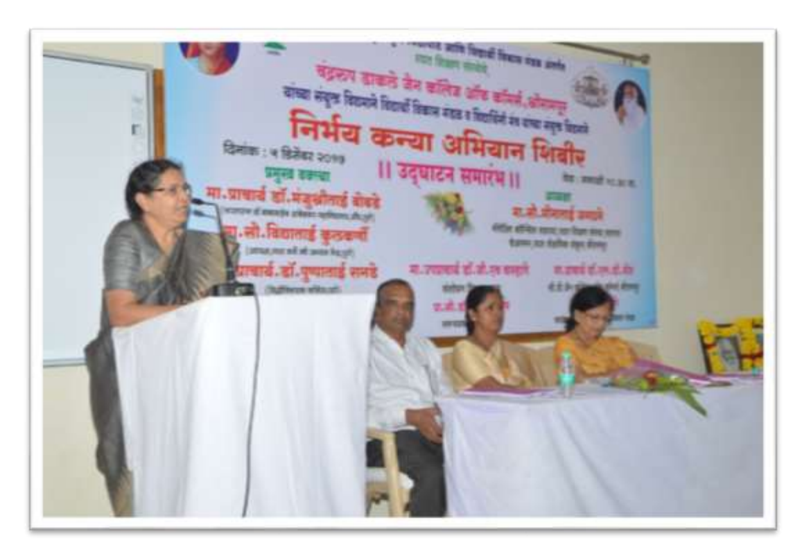
Hon. Pushpatai Ranade guided on "Sexual Harassment Cases" how to prohibit it in the work place and college.