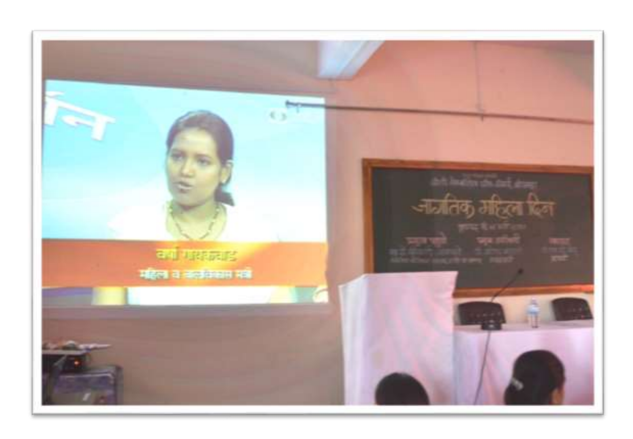
Hon. Varshatai Gaikwad (Minister, Women Welfare, Maharashtra Government ) Interview shown to the students on the occasion of "Worlds Women Day"