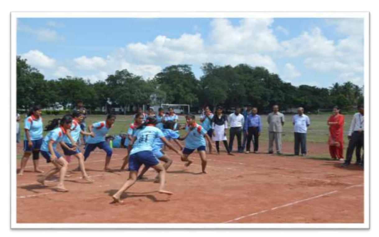
Participation of Girls in District Level Competition of Kabbaddi