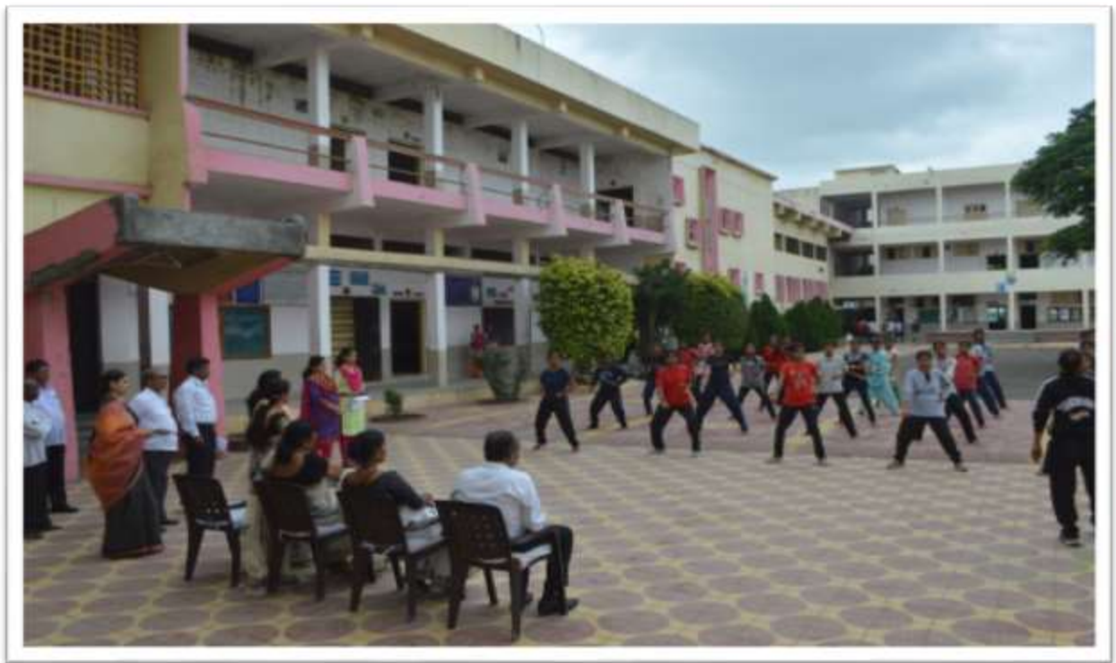
Self-Defiance Training programme organized by the college.