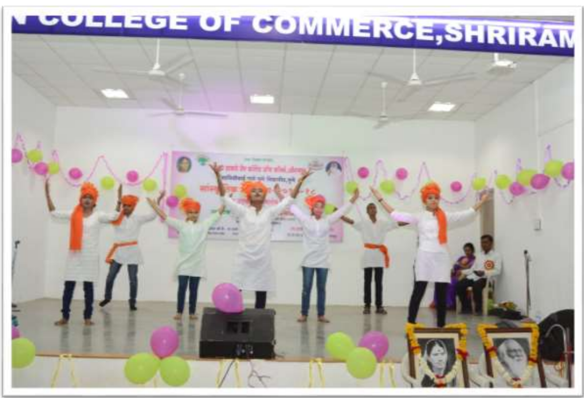
Participation in Cultural Activity by Girls Students