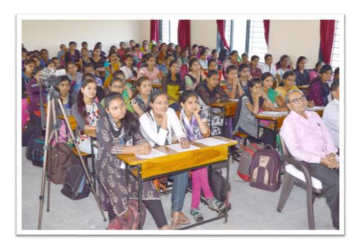
Students enjoying lecture organized by Women Empowerment Cell.