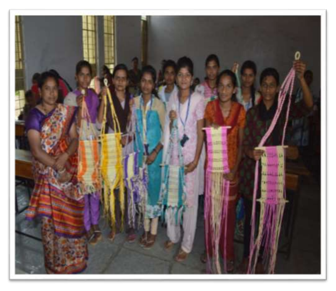
Microme Course students showing their arts