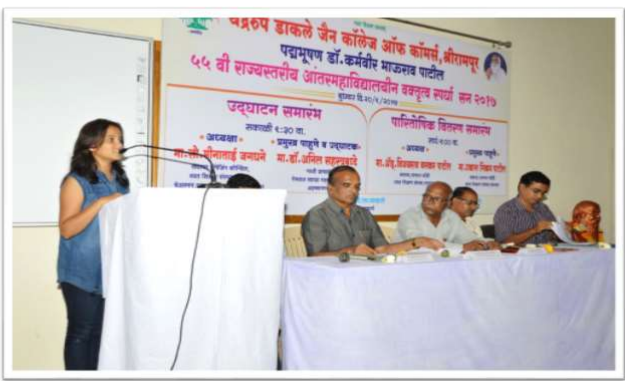
Girls students are presenting their views and thought about Women empowerment in Elocution Competition