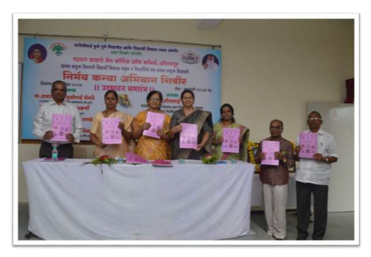
Inauguration of booklet "Haemoglobin Checkup of Girls" prepared by the Women Empowerment Cell.