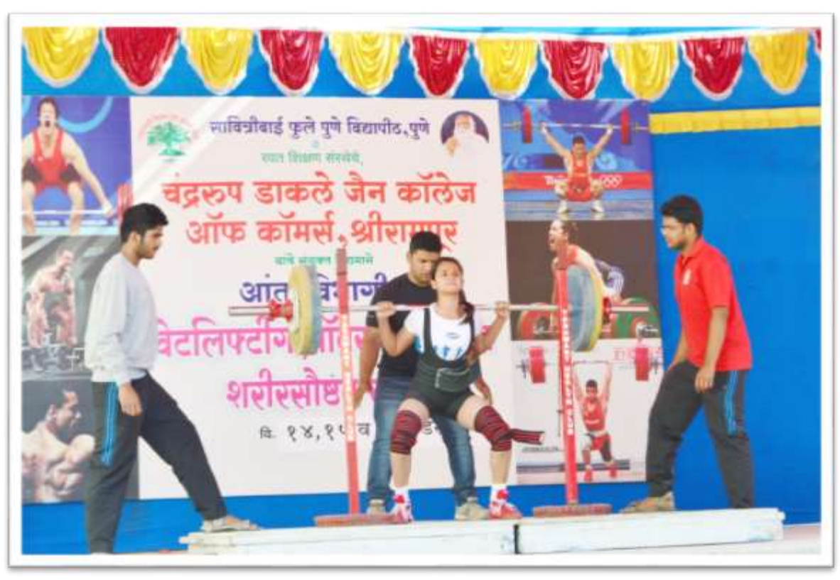
Participation of Girls Students at University Level Weight Lifting Competition.