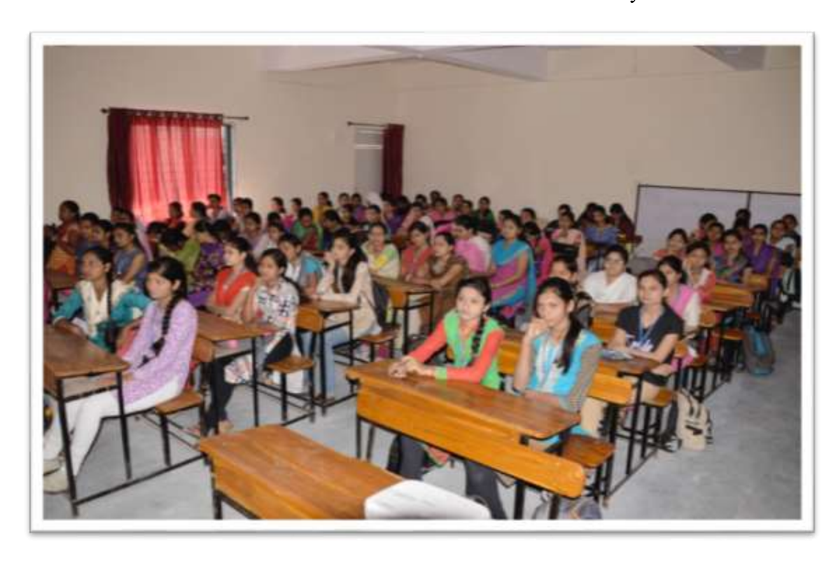
Girl Students engaged in listening programme organized by Women Empowerment Cell.