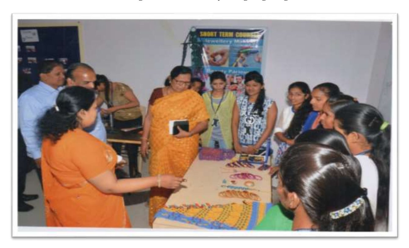
Training course of Jewelery Designing for girls.