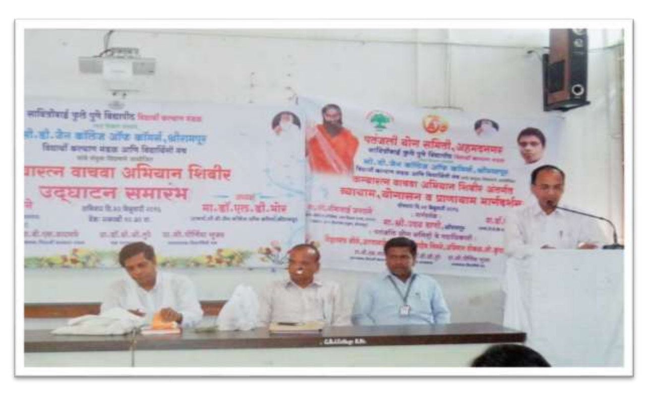
Hon. Uday Wani (Patanjali Yog Samiti) guided regarding "Importance of Yoga and Health"