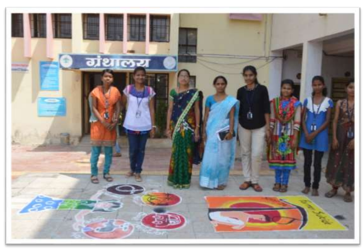
Rangoli Competition based on Social Issues